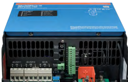
Connection Area MultiPlus-II 3k